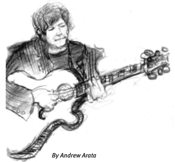
By Andrew Arata

Please remember that SECOND SATURDAY is only possible with the generosity and participation of local businesses.